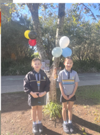
Rugs and Reading