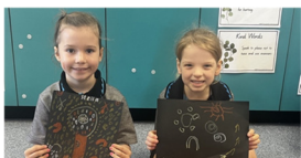
Prep Art Work - Aboriginal symbols

We pray - Gracious God, we want all peoples to live justly and peacefully together in this land. We thank you for our First Nations people who have stood proudly and confidently, wanting to promote their culture and history. May we work together to embrace and celebrate all that is similar and all that is different between us. We ask this prayer through Jesus, your Son.