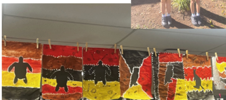
Year 3 Art - Indigenous Painting