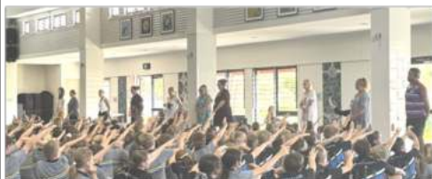
Children bless their teachers on assembly.

Thanks to our Year 11 Mission Ambassadors who spoke about Catholic Mission at some of the Parish Masses last weekend... as promised, here are some photos from our Socktober celebration.