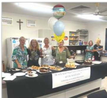
A beautiful morning tea catered by the P&F