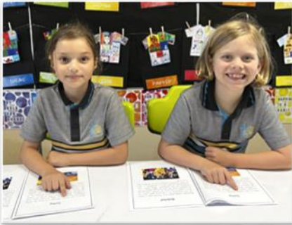
Word Noticing Walls

Partner reading involves two students working together in a supportive environment. During Partner Reading, students read a text aloud, taking turns in the reading so that they can support each other to success. It is an effective reading strategy that builds word recognition, decoding, fluency, and vocabulary development.